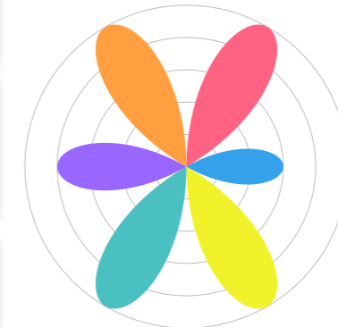
What do these levels mean?

Students at this level use a blend of tools to design and refine their communication in order to deliver a compelling message that expands perspectives.